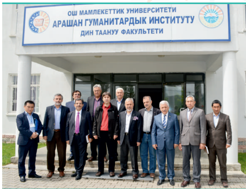
Visiting to Araşan Faculty of Theology