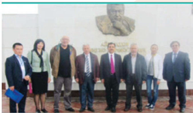
Visiting to Cengiz Aitaymatov's Museum with his son former Foreign Minister Asgar Aitmatov